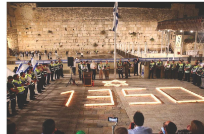
Israeli casualties of October 7th, 2023

Shaving Israel P. O. Box 6991 Chesterfield, MO 63006-6991